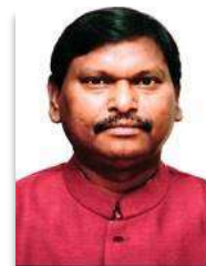
Minister of Tribal Affairs, Shri Arjun Munda

On 15th May 2020, Hon'ble Minister of Tribal Affairs, Shri Arjun Munda launched GOAL initiative, a Facebook funded program in collaboration with the Ministry of Tribal Affairs, aimed at upskilling and empowering tribal youth across India to become digital young leaders. This event was also graced by the presence of Hon'ble MoS, Smt. Renuka Singh Saruta.