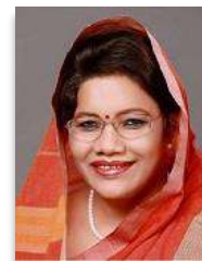
Minister of State, Smt. Renuka Singh Saruta