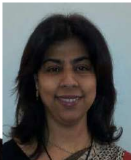
Dr. Nanwani Sadhu Vaswani Institute of Mgt. Studies